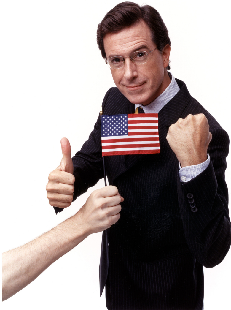
Above: Dr. Steven Tyrone Colbert, DFA. A Megamarican Hero, in a trademark supergravitistic pose.

In addition to his televised work, Stephen has penned three best-selling books. These include Don't Buy This Book if You Don't Have the Balls ; Silent Night: Reassessing the Sociological Imprint of the Tiananmen Square Massacre ; and Don't Buy This Book if You Don't Have the Balls - for Kids .